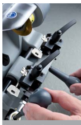
Anatomic handles and levers

Fastbit is designed to be comfortable and ergonomic: