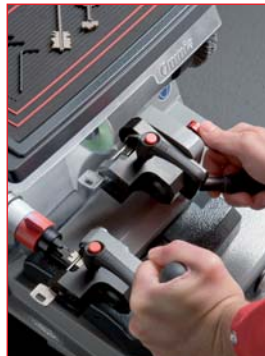
Smooth carriage movements

The integrated accessories area on top of the machine is particularly wide and capacious, allowing you to easily place accessories and keys. The incorporated tool holder dedicated to female keys tailstocks (optional) guarantees quick identification and immediate finding of the right accessory. Swarf collection in the dedicated tray,