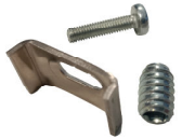
1 x AX1170 (m) 6 x Undermount clip, 6 x 17mm long x Ø10.64 soft thread tapex & 6 x 30mm domehead screw