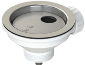
1 x AX1002 (m) 90mm (1.5") Orbit manual basket strainer waste - long bolt