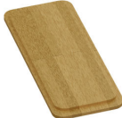
1 x AX2024 System Bamboo Chopping Board

All accessories can be purchased directly from www.abode-shop.co.uk or phone 01226 283434