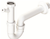
1 x AX1008 (m) 1.0 Bowl pipework