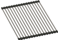
1 x AX2506 System Drainer / Trivet (roll up)