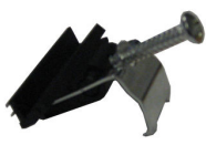
1 x AX1032 Composite inset fixing clips x 6