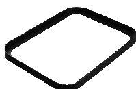
1 x ABX1151 CAVA Tablet Basin Plinth Matt Black