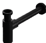
1 x ABX1021 Basin Bottle Trap Matt Black