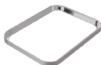
1 x ABX1150 CAVA Tablet Basin Plinth Chrome