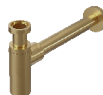
1 x ABX1022 Basin Bottle Trap Brushed Brass

All accessories can be purchased directly from www.abode-shop.co.uk or phone 01226 283434