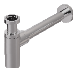
1 x ABX1020 Basin Bottle Trap Chrome