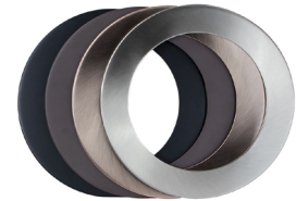
Field Installable Trim Kits: Black, Bronze, Copper & Brushed Nickel