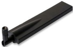
6 Band LTE Blade