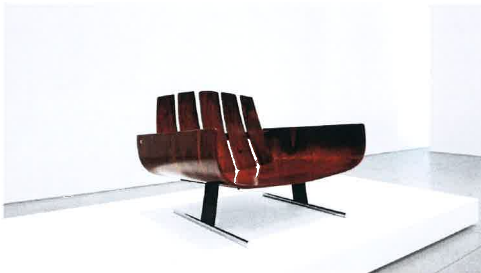
Jorge Zalszupin's Presidential Armchair is an example of Brazilian design that will be included.