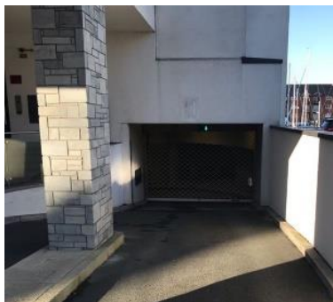
Allocated Parking Space (7)

(Underground Parking is accessible with a key Fob)