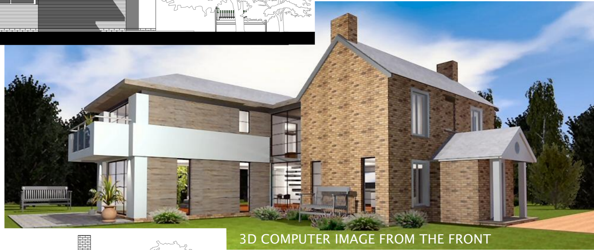
3D COMPUTER IMAGE FROM THE FRONT