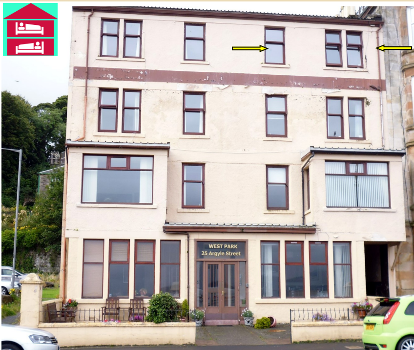
8, West Park, Argyle Street Rothsay, Isle of Bute

Tel: 01700 505551 Fax: 01700 505270 www.wmskelton.co.uk email: contactus@wmskelton.co.uk