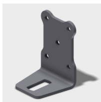
SA238 - 50mm 5 Hole Through Slot Bracket

Once the brackets are fitted to the shelter then place the end of the anchor through the slot and drive it in using a short handled sledge hammer. The anchors can be removed by unscrewing them with a 29mm socket or spanner.