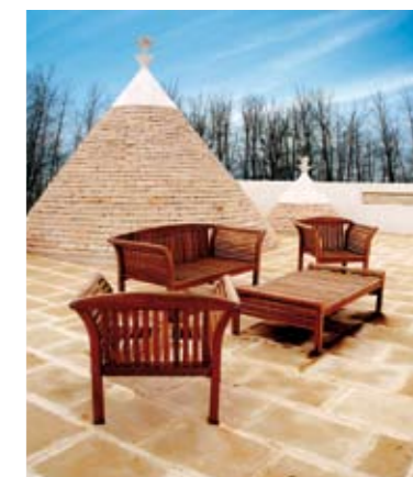
Left Cathy translates the local trattoria's menu for a guest; the front of the trullo retains its original charm Above the quiet lanes are ideal for cycling; the kitchen is fully equipped for cooking up a storm Below up on the roof – the trullo has plenty of suntraps; the house has lots of hidey-holes and character features

If you're interested in staying at Trullo Solari, call Cathy Upton on 07973 942508 or 0039 339 487 6017 or visit www.trullosolari.com .