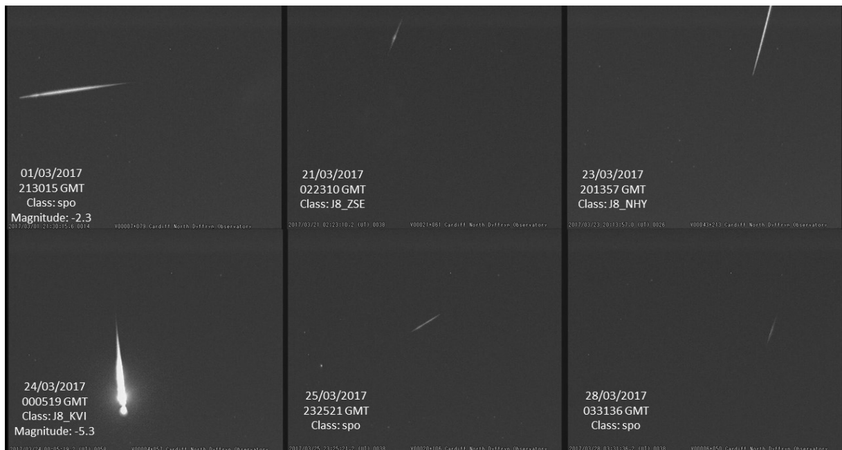
CARDIFF CAMERA 2 – NORTH VIEWING – MARCH 2017