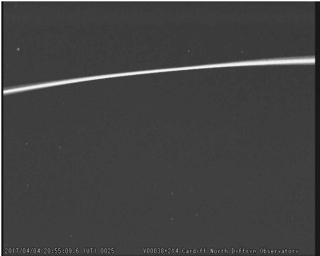
Transit of the International Space Station 4 th April 2017 20:55 UT

At the beginning of April 2017 UKMON ran some statistical scripts for all the individual UK stations and provided a compiled report for all stations, these two reports can be accessed either at the CAS_UKMON website or the UKMON website.