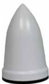
Figure 3: PCTEL L1/L2 GPS with Quadrifilar Helix Antenna

These programmatic changes and reprioritization of military initiatives are strongly influenced by the global security environment. If there is a signal coming from the present administration, it seems to indicate that the time for revolutionary systems is over, and emphasis will be placed on procuring solutions that work right now, or have a high probability of working in the future. 3