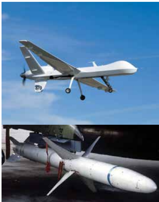
Figure 7: (top) UAV and munitions guidance applications. (bottom) HARM with GPS L1 and L2 antennas

PCTEL, Inc. (NASDAQ: PCTI) is a leading supplier of specialized military antenna systems. PCTEL's antennas are equipped with