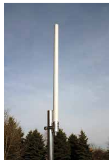
Figure 6: Multi-band 802.11 abgn omnidirectional base antenna.