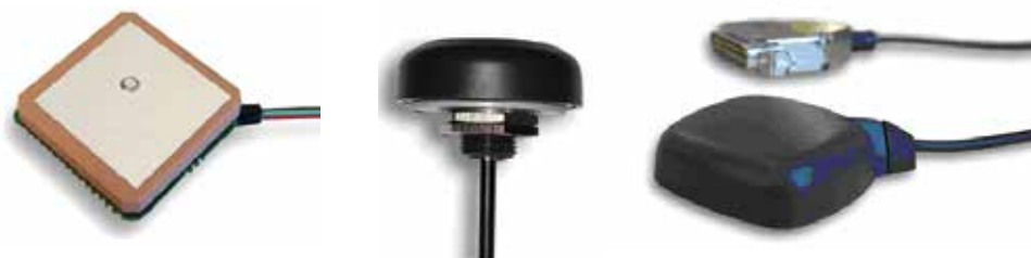
Figure 4: Precision GPS Navigation units with integrated receiver.