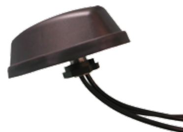
Figure 5: Low profile wide bandwidth mobile with GPS

Communication with land-based infrastructure requires high performance and ruggedized mobile antenna platforms. Figure 5 shows a low profile wide bandwidth mobile antenna with separate RF and GPS ports. This antenna provides efficient voice and data communication to multiple communications bands, from 698 MHz to 6000 MHz, including GPS (1575.42 MHz), UHF voice data (698-960 MHz), PCS/DCS (1710 - 2170 MHz), WiMAX (3300-3800 MHz) and licensed and unlicensed wireless broadband data (2200-2700 MHz and 4400-5900 MHz). Typical gain for this wide bandwidth omni ranges from 1 dBi at the