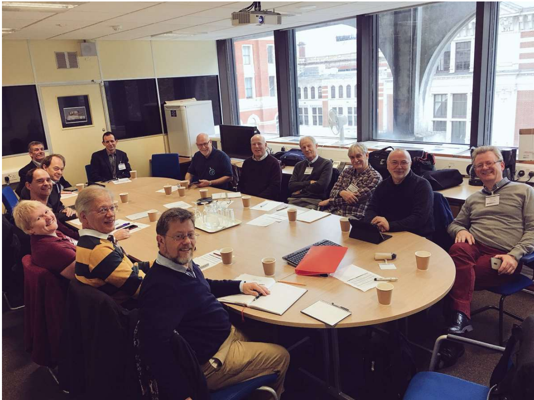
3 rd UKMON Meeting at the Natural History Museum, London 18/11/2017