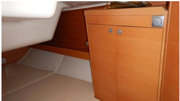
Aft Cabin Cupboard