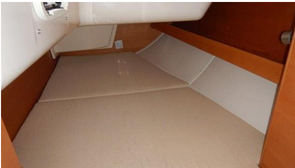
Portside Aft Cabin