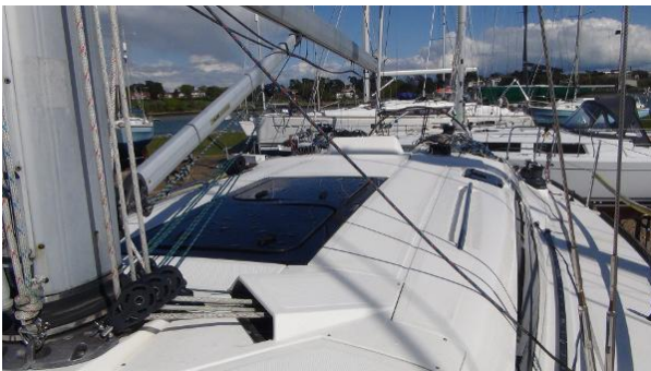
All Lines Led Aft