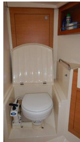
Heads 1 Shower Seat