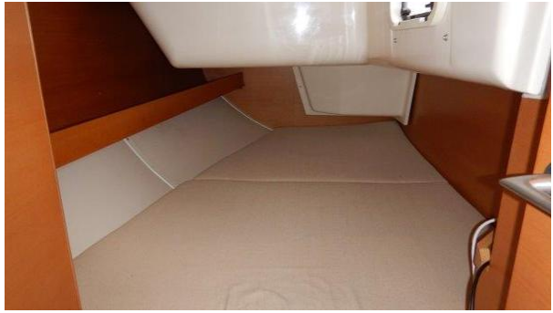
Starboardside Aft Cabin