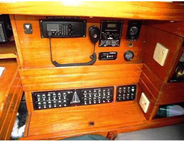
Instruments below deck