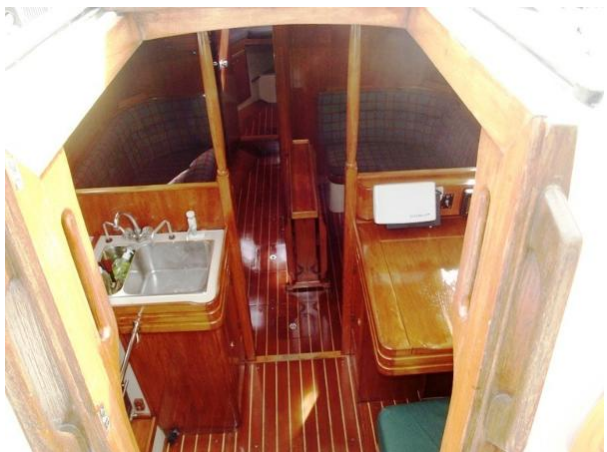
View from Companionway