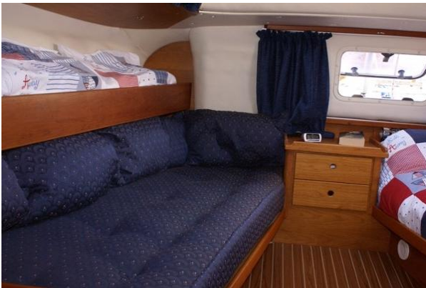
Aft Cabin Seating & Dressing Area