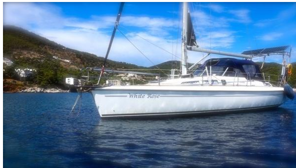
White Rose at Anchor