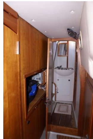
Heads Entrance from Aft Cabin