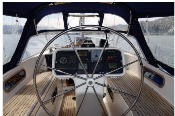
Steering Wheel under Sprayhood