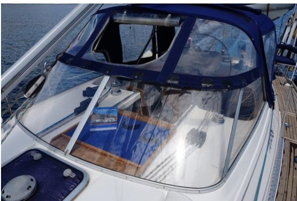
Sprayhood & Extension