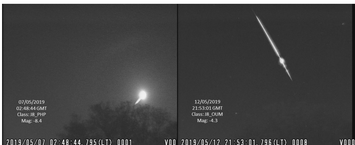
CARDIFF CAMERA 1 – EAST VIEWING – MAY 2019