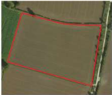
Up to 2018, original field boundary

Scenario 1: part of an existing field is permanently removed from the field: