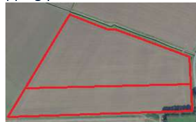
2019, field split differently

Regions are controlled through the cropping record. To change a field region: