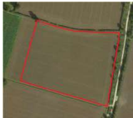
From 2018, new field boundary with new region

Scenario 2: a field is split in two different ways in different cropping years: