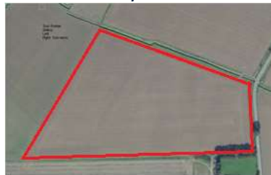
2017-2018 whole field