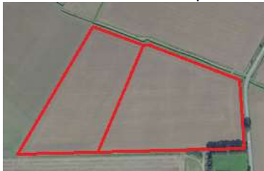
2016, field split

Scenario 2: a field is split in two different ways in different cropping years: