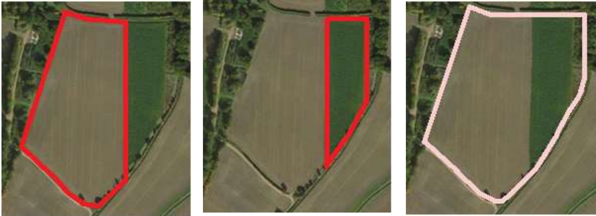
Part A cropping boundary

Once a field is split (the cropping record is divided), the cropping boundary layer allows you to associate a boundary to each cropping record of the field. The whole field layer is the joined cropping boundaries: