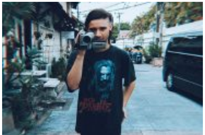
Skrillex hits 'Midnight Hour' with Ty Dolla $ign and Boys Noize