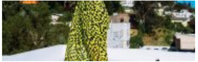
Nina Las Vegas on Diplo stealing her style for the Grammys