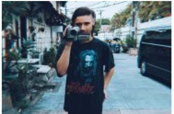
Skrillex hits 'Midnight Hour' with Ty Dolla $ign and Boys Noize