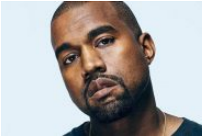
Kanye West's new album 'Jesus Is King' drops this September