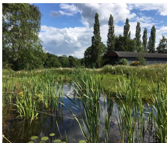
New habitats created by HS2 in Warwickshire