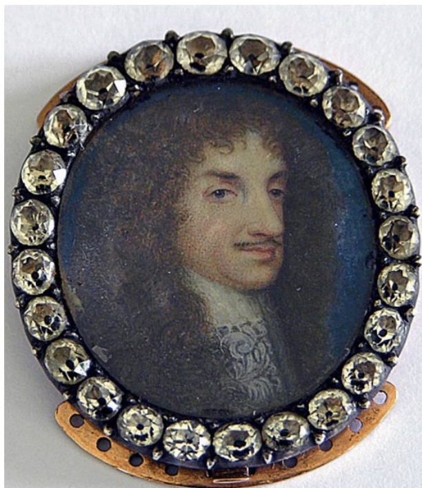
Miniature of King Charles II. Circle of Samuel Cooper. Private Collection.

Samuel Cooper, an artist much in demand during the 1660s. Cooper's workshop produced many miniatures of Charles; one of the more modest examples, encircled with glass 'diamonds', appears on page 3 of your handout and may represent the kind of gift that Corbetta received. It was a mark of considerable favour to receive such a reminder of the royal presence, worn on a chain around the neck.