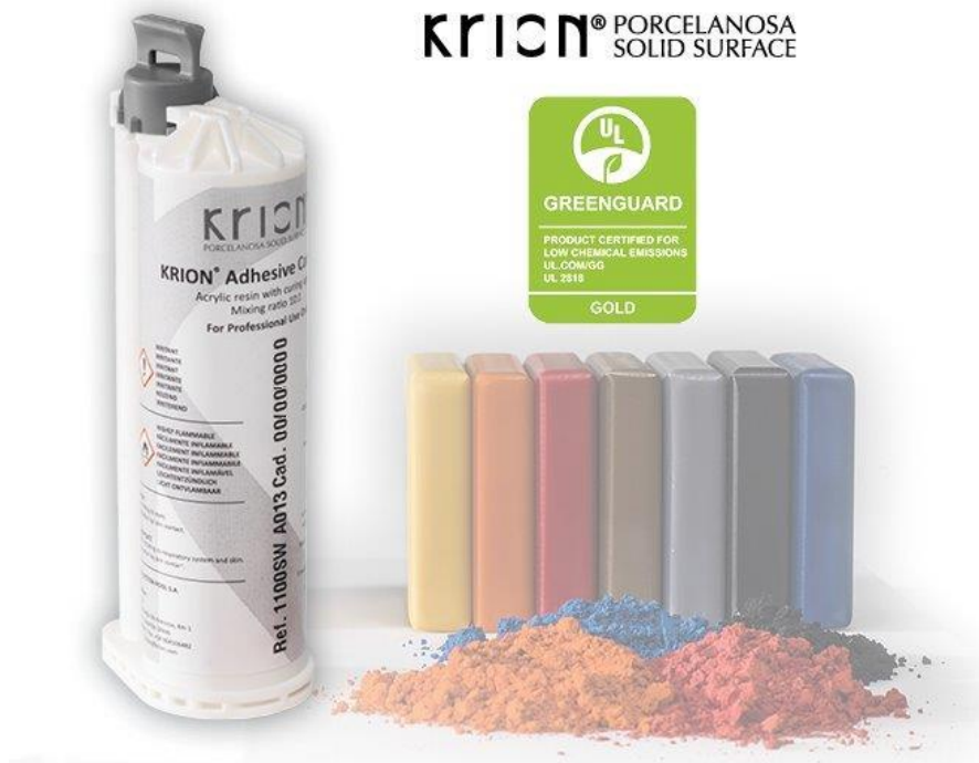
Illustration 1. KRION® Porcelanosa Solid Surface Adhesive.

The main recommended use for this product is to serve as an adhesive for the joining and sealing of solid surfaces.