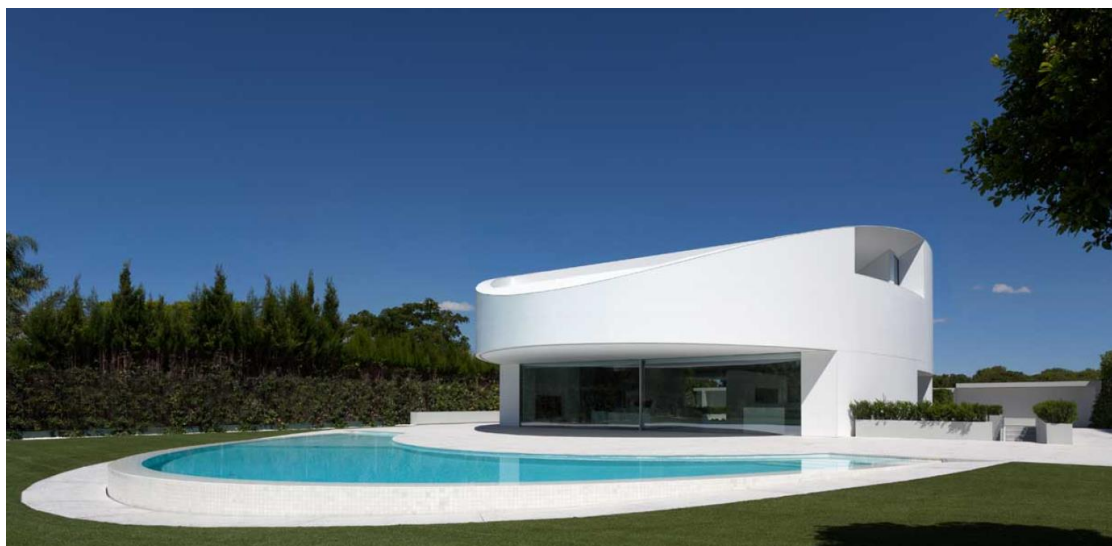
Illustration 1. KRION® Porcelanosa Solid Surface.