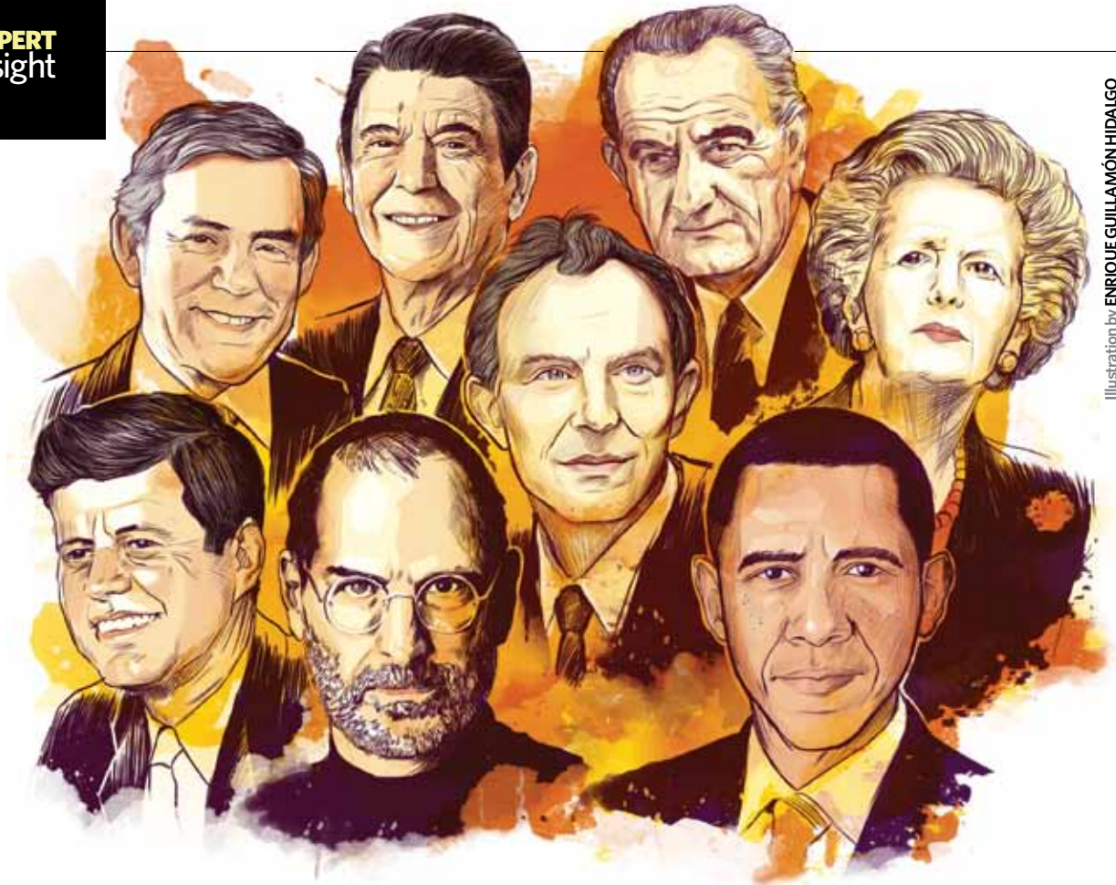
Illustration by ENRIQUE GUILLAMÓN HIDALGO