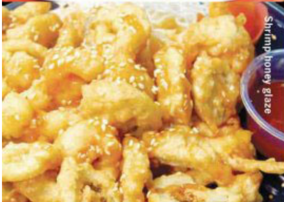
Shrimp honey glaze