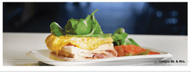
Croque Mr. & Mrs.