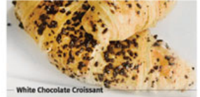
White Chocolate Croissant