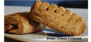
Brown Cheese Croissant