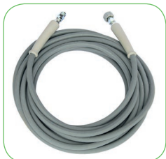
10 m high pressure hose (3/8") code : 1.208.520.020