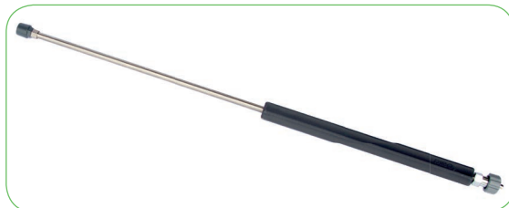
Single stainless steel lance with high pressure nozzle and rotating quick coupling code : 1.216.725.15050