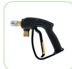
High pressure gun with swivel code : 1.211.525