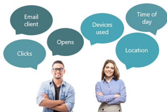
Figure 1: Leveraging email marketing metrics

The first thing to think about is this idea of leveraging email marketing metrics. You use your data, your analytics, to develop your persona. What client are people using? Are they on a mobile device? Are they on a desktop? Looking at your clicks, did people click certain bits of content, certain elements? Did they ignore other pieces of content? Look at your open rates, you know, time of day. When did people open your content? Is everyone looking at it in the evening, or in the morning? Is it kind of across the board? What devices are they using, such as from iOS to Android to desktop PC to Mac? And then location, where are they located? Because, once again, it can give you a clearer picture of your audience and which will then help you just tweak and mold and create a voice that fits well with your readers. And you call it persona development. You might call it voice. You might call it tone, but use your analytics, use your data to help you create that persona.