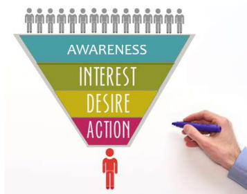
Figure 2: The purchase funnel

We've spoken a little bit about the phases that people go through when they're considering buying a product.