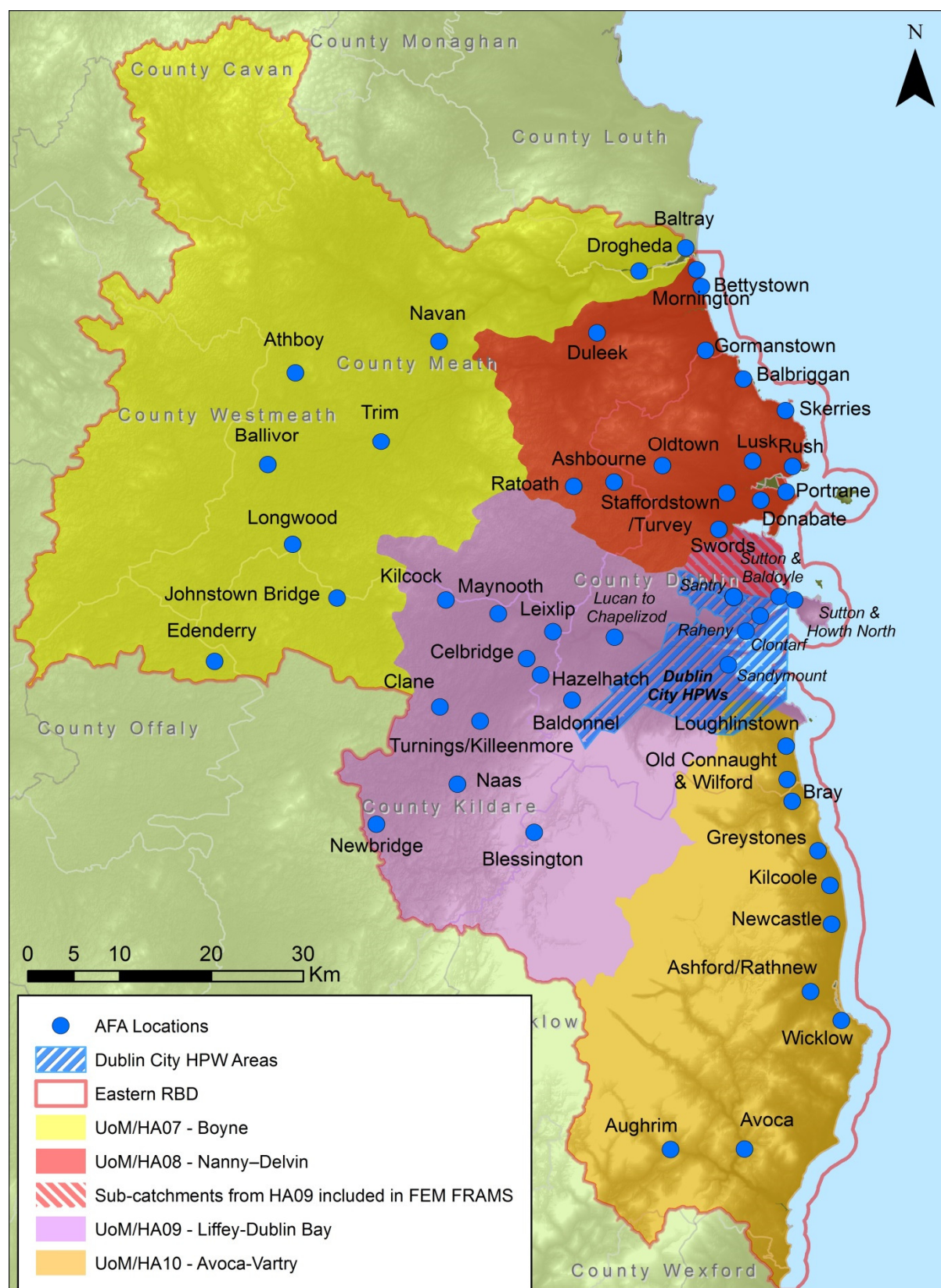
Figure 3.1: The Eastern CFRAM Study Area and its Associated Units of Management