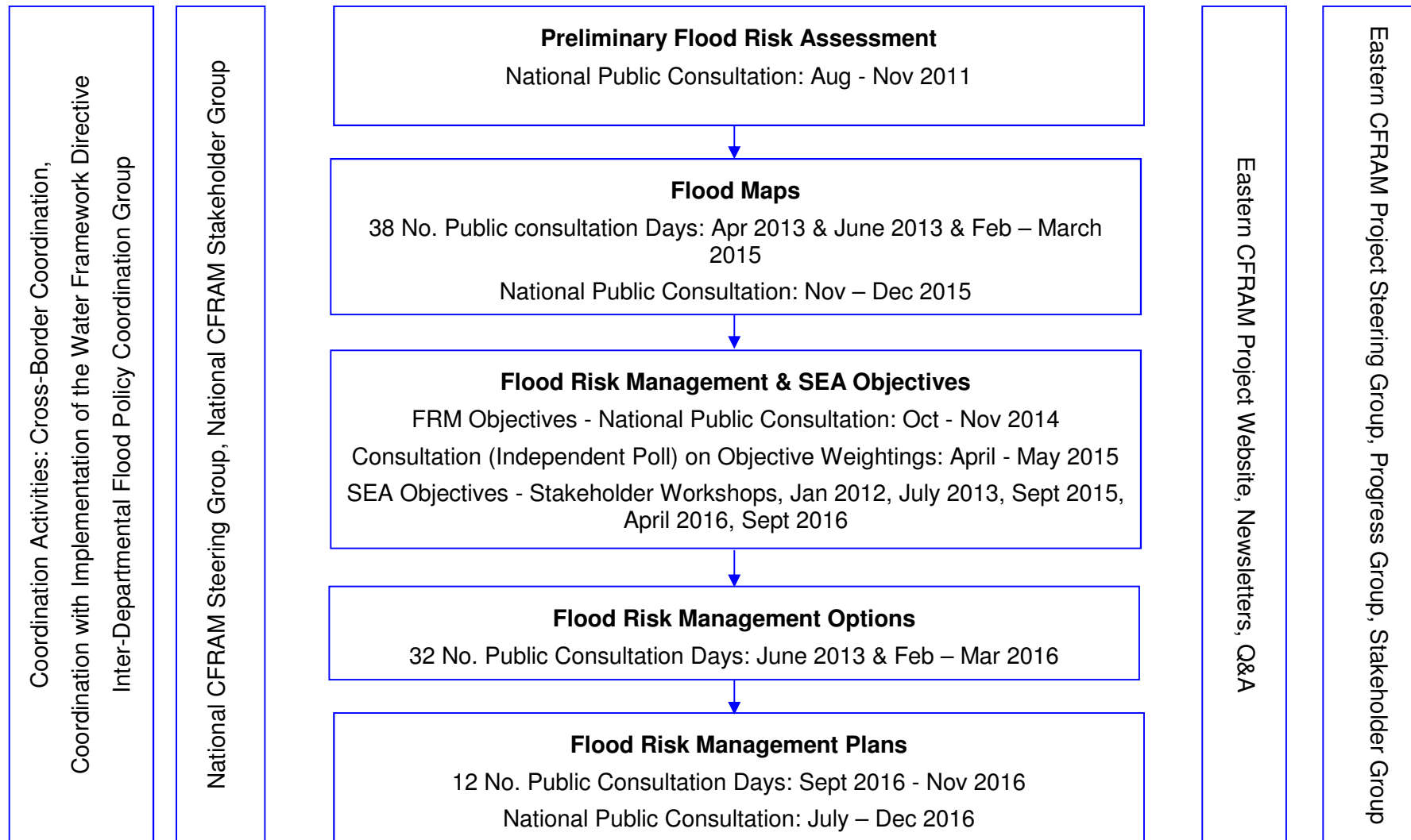
Figure 2.2 Overview of the Eastern CFRAM Consultation Stages and Structures