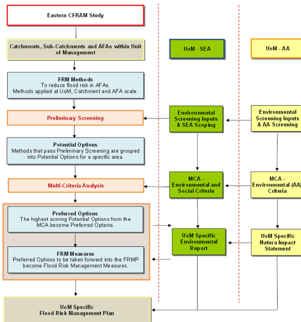
Figure 3.1 Interactions of the Plan and Environmental Assessments

A draft Plan was produced for the Avoca-Vartry River Basin within the Eastern CFRAM Study Area. The SEA Environmental Report was produced to assess the environmental impacts of the FRM options (alternatives) of the Plan and to provide the environmental guidance to help create a more sustainable Plan. In parallel to this a NIS was prepared to inform the decision making process, in terms of the potential for the FRM options to impact the integrity of any European sites, in view of that sites conservation objectives. Both environmental assessments were central to the development of the draft Plan for the Avoca-Vartry River Basin. The following section demonstrates the interactions between the various levels of environmental assessment and the stages at which these assessments will have influenced the Plan. A summary graphic of these interactions, and where environmental assessments were incorporated into the Plan process, is shown in Figure 3.1 .