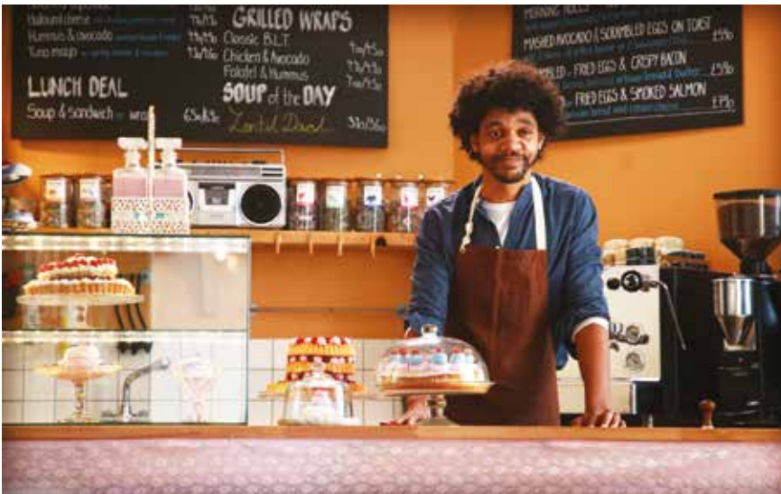
Image from LendingCrowd television advert