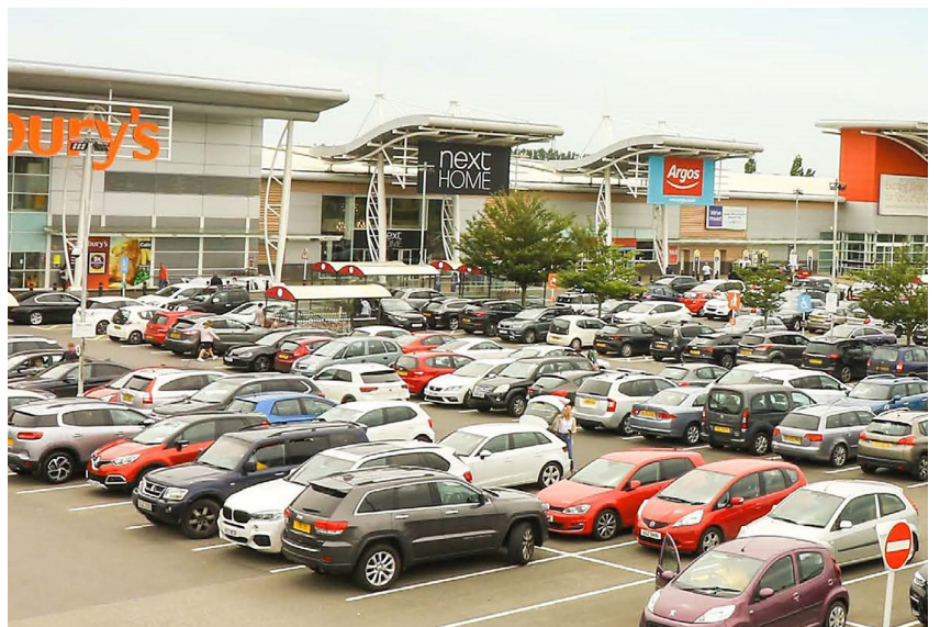
Top to bottom: Lisnagelvin Retail Park, Orritor Road Retail Park, Sprucefield Centre