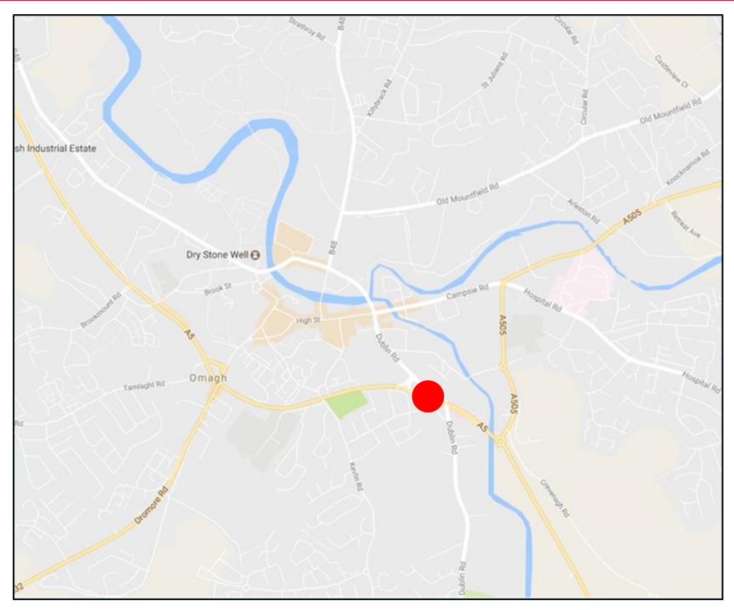
Not to scale/for identification purposes only