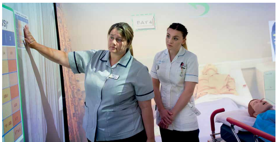
Student nurses in simulated ward scenario (top) and discussing vital signs observations in interactive immersive simulation suite

supplemented with further reading. Lecturers will be given preparatory training and be supported by health and social care technicians in the mock ward.