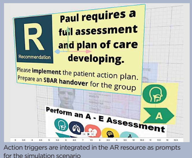
Fig 4. AR handover

Action triggers are integrated in the AR resource as prompts for the simulation scenario