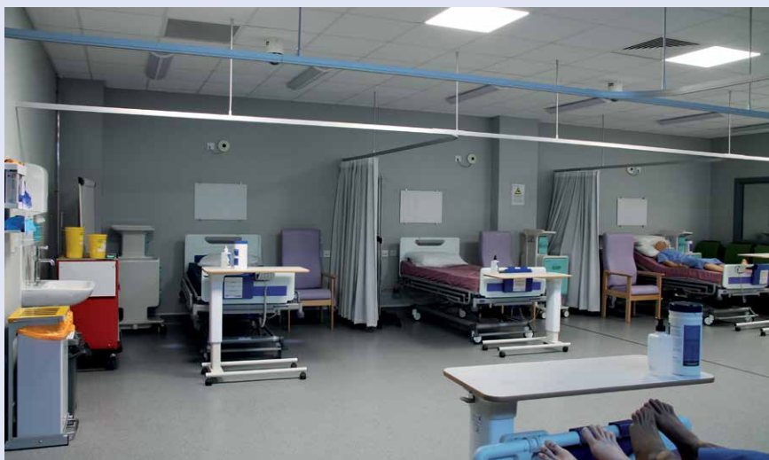
Fig 1. Mock ward, University of Derby clinical simulation suite

The spiral simulation curriculum at the University of Derby was developed to make sure the scenarios incorporate a variety of healthcare settings to contextualise the clinical environment and provide curriculum alignment to professional and regulatory standards. The delivery of simulation at the university takes place in areas that recreate an acute hospital ward setting (Fig 1). This is supported by immersive suites – rooms enabled for projection on to three walls (Fig 2). The immersive