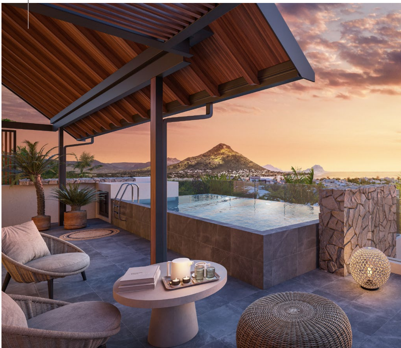
View of Le Morne and lagoon from the terrace, Penthouse with heated swimming pool, Block 5