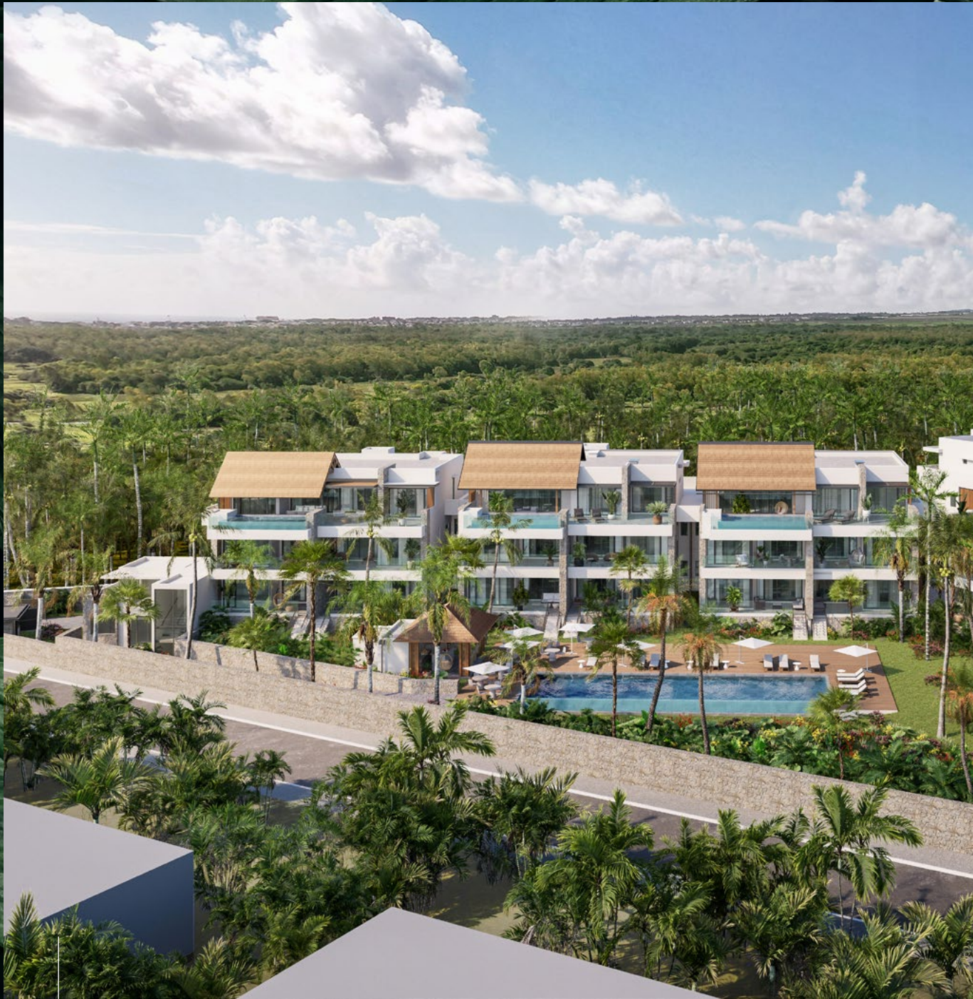
Aerial view of the project