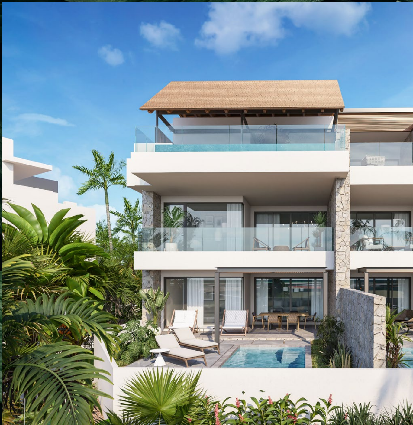
View apartment block 6