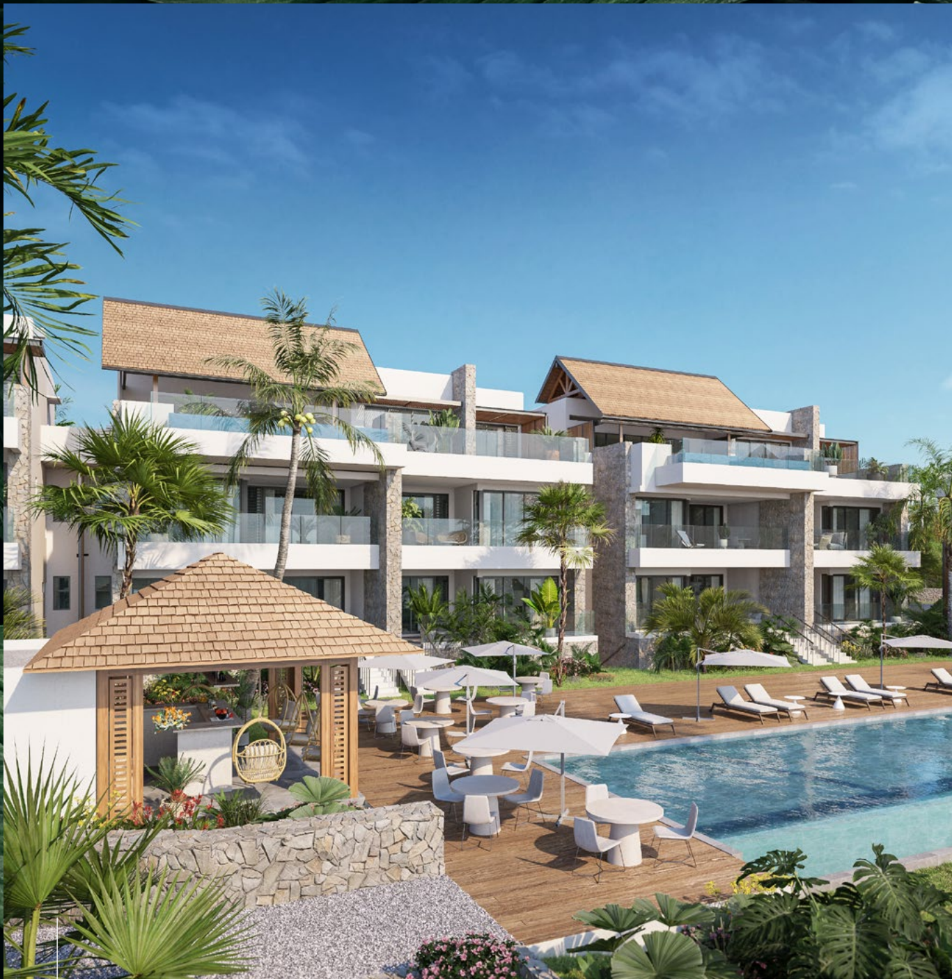
View of the shared heated swimming pool