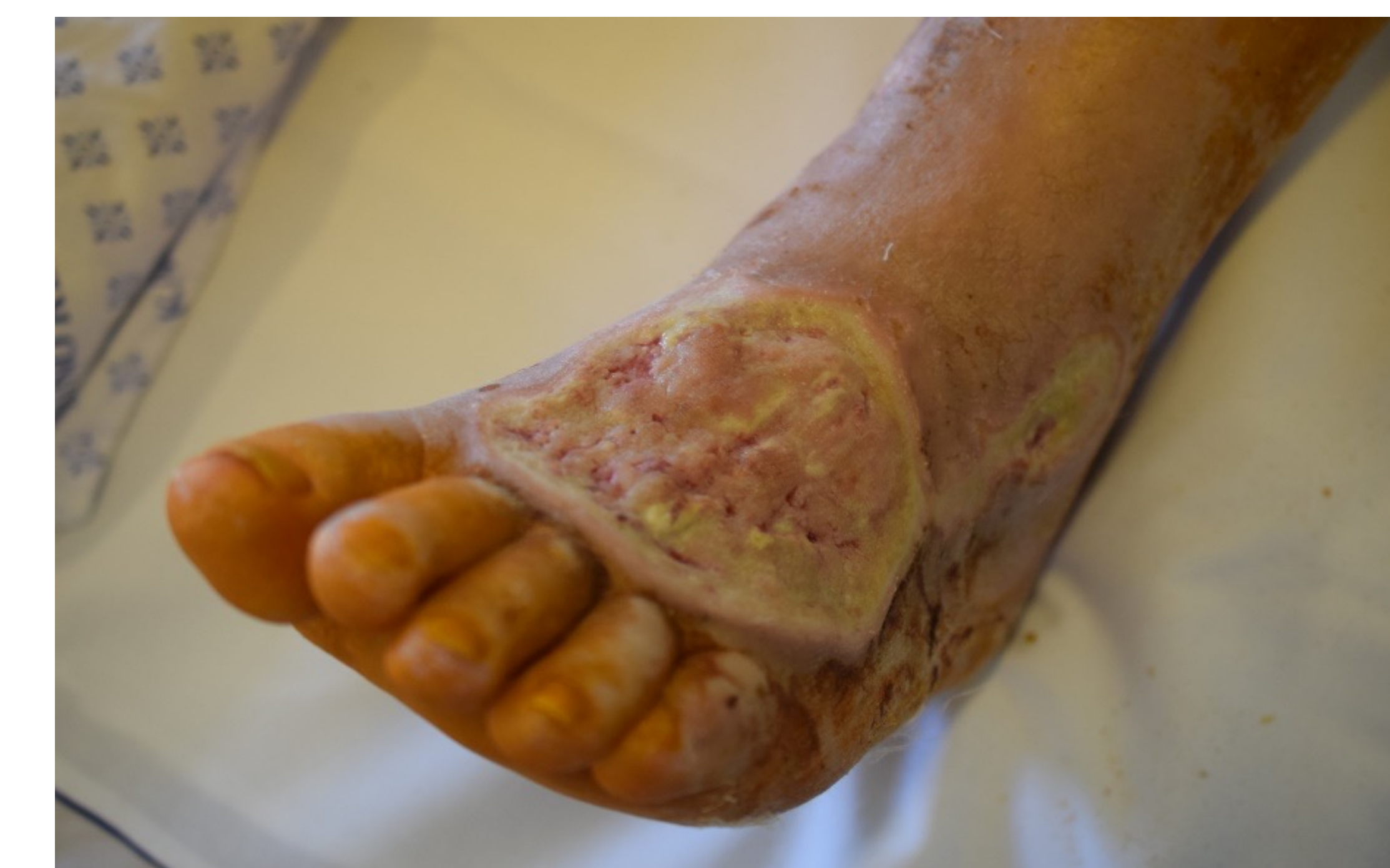
Fig. 2. Arterial ulcer - 11x9 cm, depth - 0.8 cm. Duration - 4 months. On the surface - fibrin