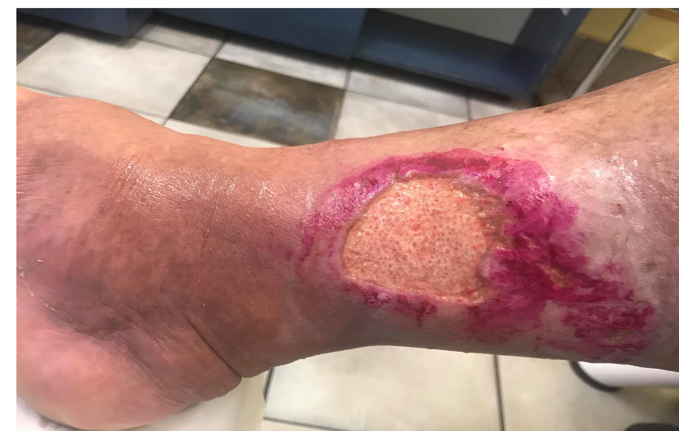
Fig.1. Venous ulcer - 7.5x5 cm, depth - 0.4 cm. Duration - 5 months. On the surface – granulation tissue

The majority of chronic wounds are venous, have a flushed edge and/or flushed surrounding skin, more than half of chronic wounds has malodour. When planning the treatment of chronic wounds, it is essential to note that wound odour worsens the patient's physical well-being, daily activities and the general quality of life more than pain at rest.