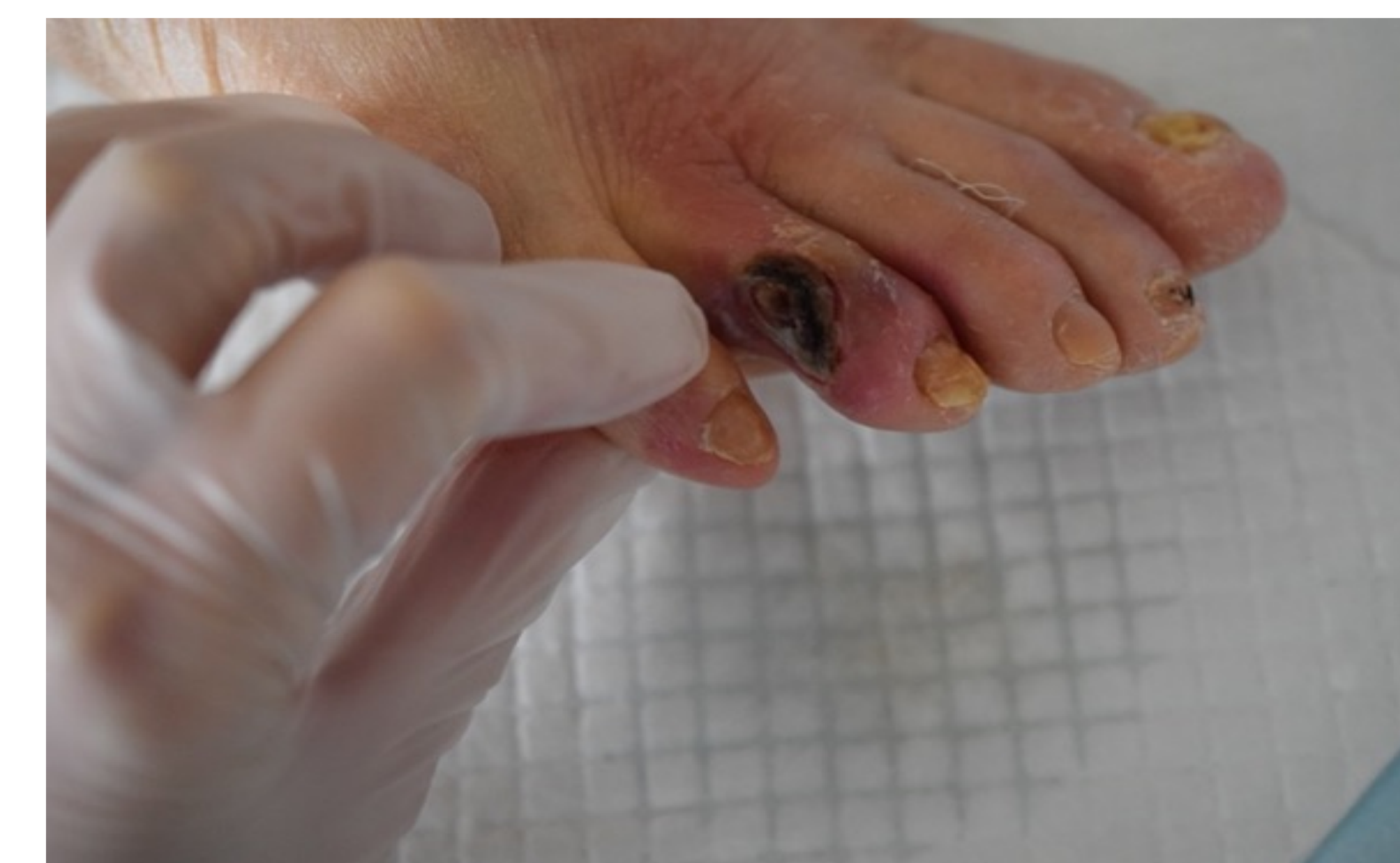
Fig. 3. Diabetic ulcer - 1.8x1.5 cm, depth - 0.3 cm. Duration - 3 months. On the surface - necrosis