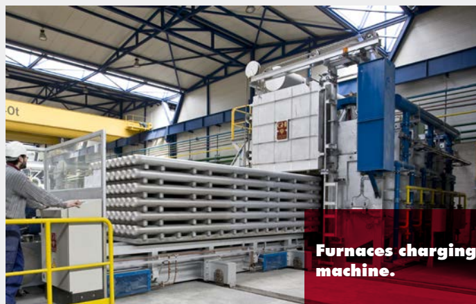
Furnaces charging machine.