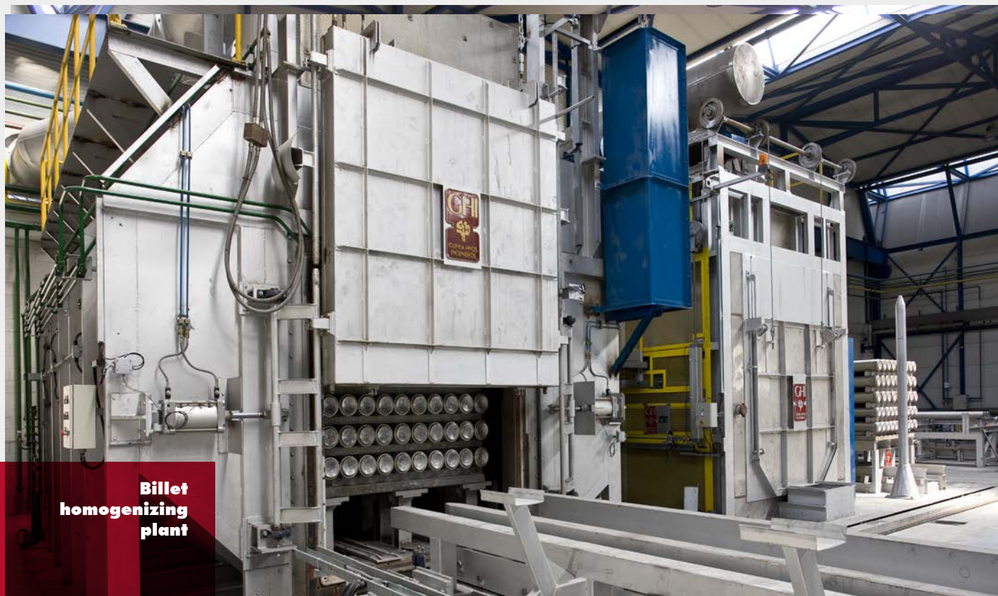
Billet homogenizing plant

Differences in concentration disappear so that not only the above mentioned advantages are achieved but also the behaviour of the metal improves substantially in the heat treatments and manufacturing processes coming after the extrusion it self.