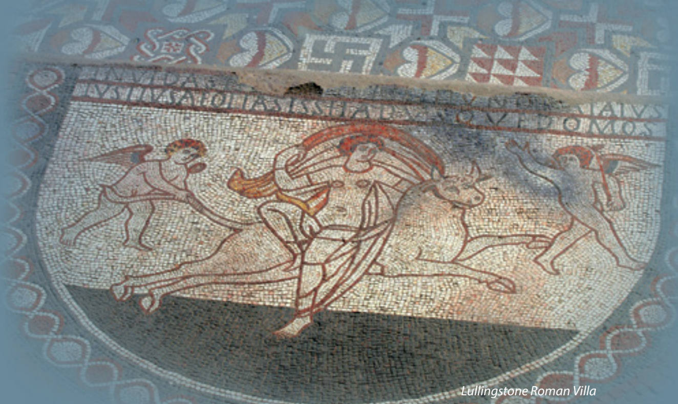
Lullingstone Roman Villa