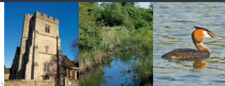
All Saints Church Holborough Marsh Great Crested Grebe

Listen out for the characteristic 'plop' of the water vole as it dives head first into the water. Water voles are the most dramatically declining of all British mammals but they do live at Leybourne Lakes so keep your eyes and ears peeled.