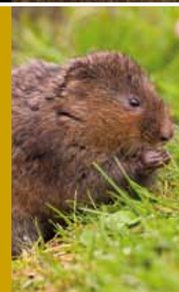
Snodland Paper Mill and Burham old church - St Mary the Virgin and Nightingale. Water Vole