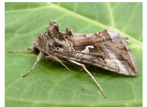
Silver Y Moth