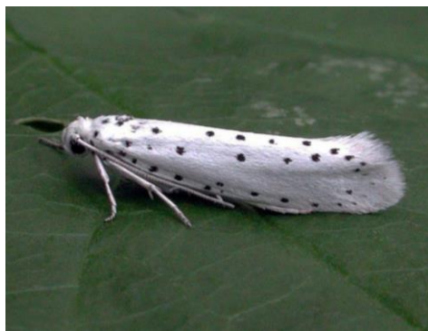
Spindle Ermine Moth