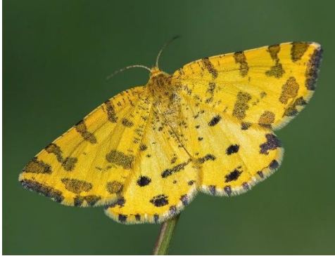
Speckled Yellow Moth