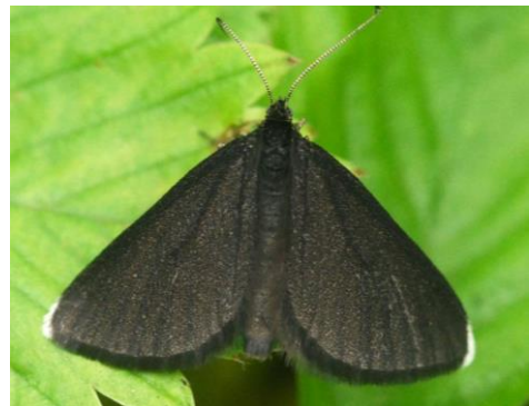
Chimney Sweeper Moth