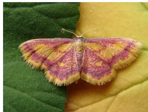
Purple-bordered Gold Moth