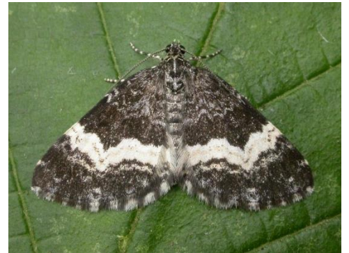
White-banded Carpet Moth