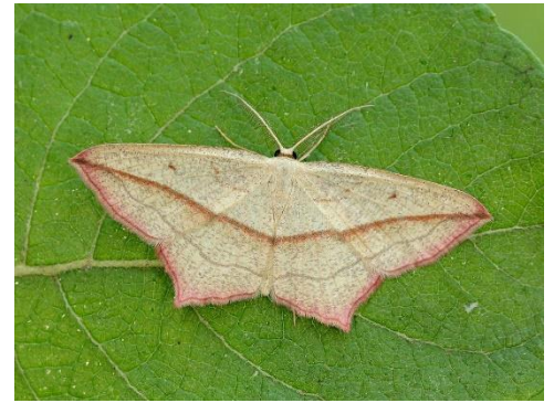
Blood Vein Moth