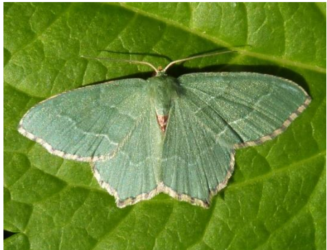
Common Emerald Moth