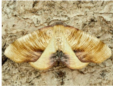
Scorched Wing Moth