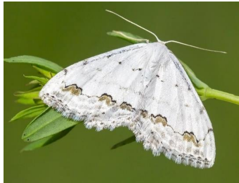
Lace Border Moth