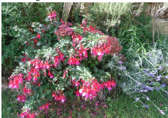
Fuchsia, Sedum and Lavender

The bee hotels are quiet now. Some tubes are protecting the next generation until they emerge in spring, others are empty and waiting for the first bees of 2021 to claim them. All are draped with the webs of the spiders which are so ubiquitous at this time of year. There are Orb Weavers spinning beautiful webs which catch the sparkling morning dew as efficiently as they catch flies. There are Labyrinth Spiders hiding out in the bee hotels, still hoping for an unsuspecting bee to buzz past so they can leap out and drag it into their tunnel, and there are False Widows lurking in the shed.