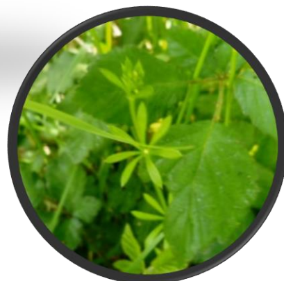
Goose grass/ sticky weed