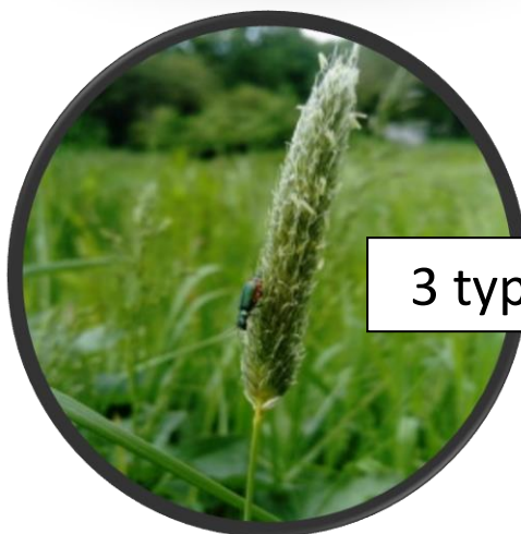
3 types of grass