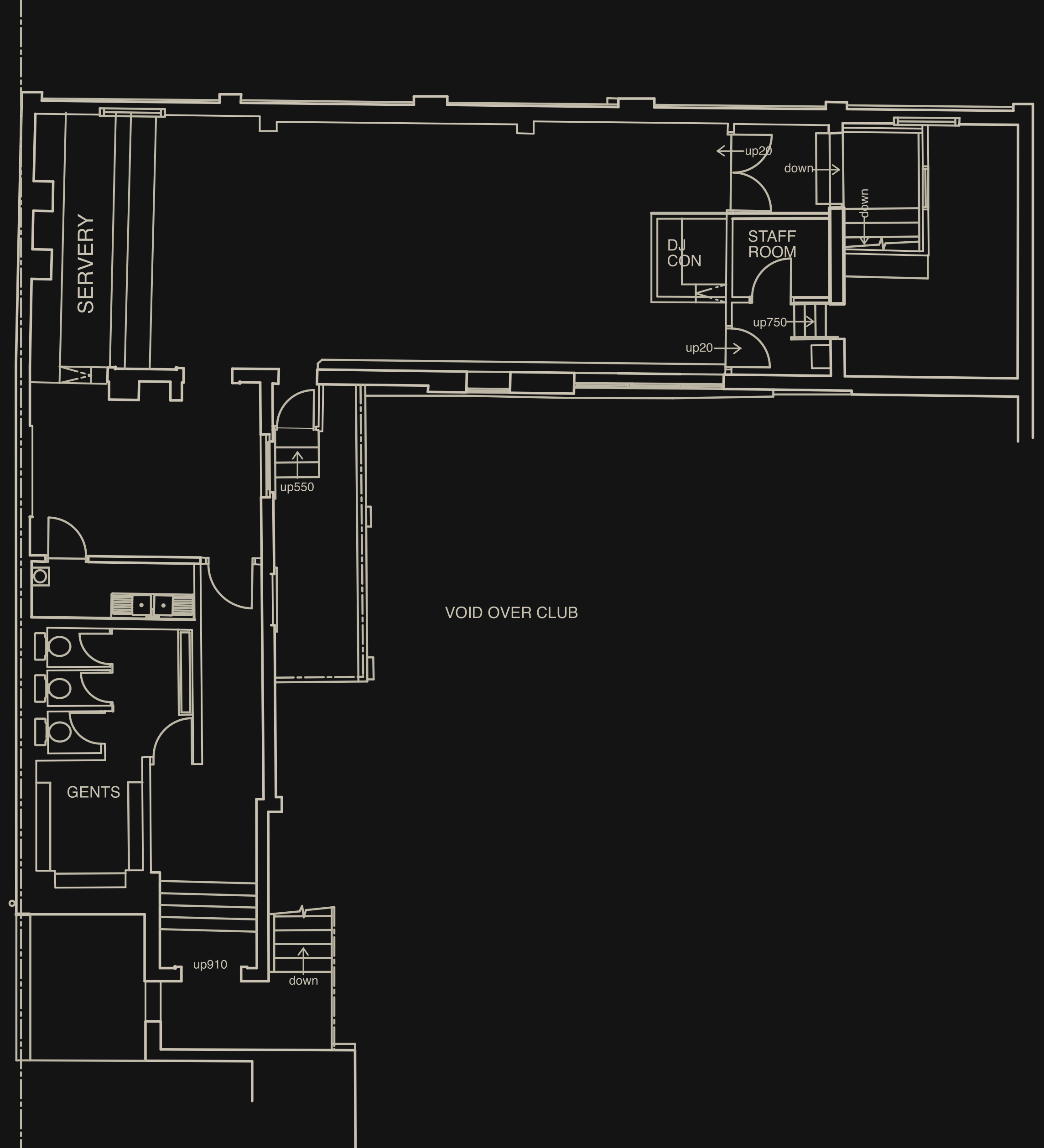
FIRST FLOOR PLAN SCALE 1:100 @ A1