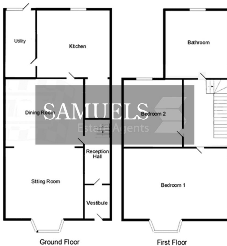
Floor plan for illustration purposes only – not to scale