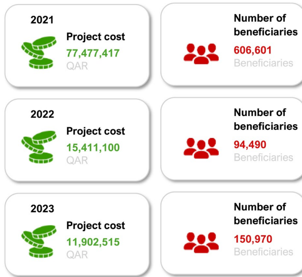
FIGURE 2 QRCS projects in Afghanistan in 2021, 2022, and 2023 (1 QAR=0.275 USD as of 2022).