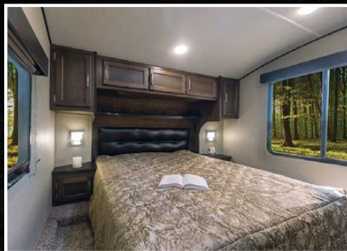
Residential Master Suite (230RL Shown)