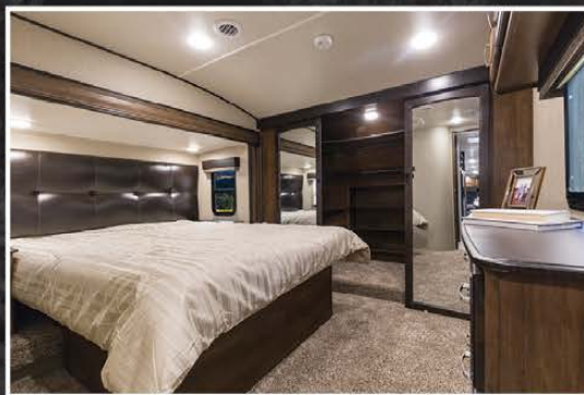
Residential Master Suite (Bed slide models shown)