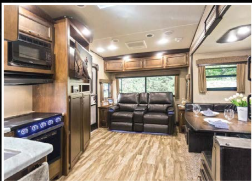
Spacious Living Area (230RL Shown)