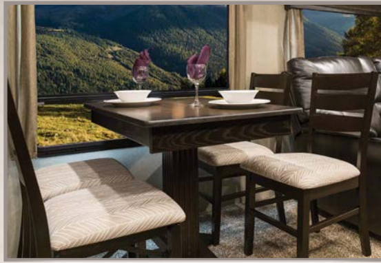
Free standing dinette w/2 folding chairs