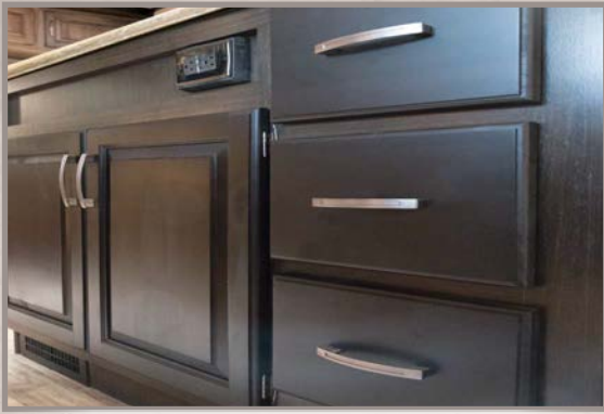
Kitchen island with bank of drawers