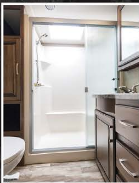
Spacious Master Bath (Bed slide models shown)

Nev-R-Adjust brakes, bronze bushings and wet bolts, rubberized suspension equalizer