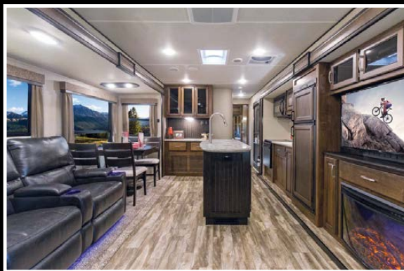
Spacious Living Area (297RSTS Shown)