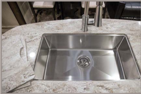
Deep seated stainless steel farmers sink