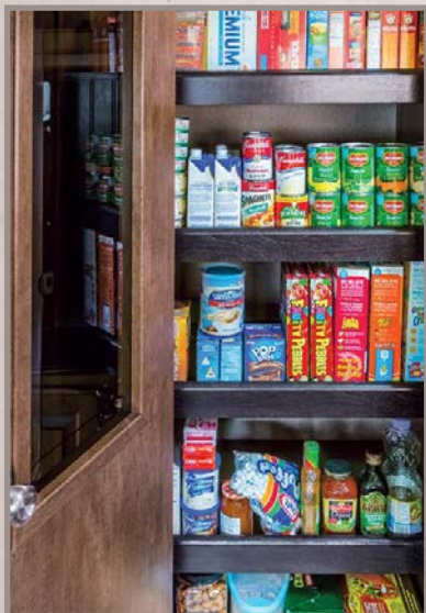
Class leading pantry storage

All-in-one heated location with EZ winterization system and exclusive siphon feature (Fresh tank)