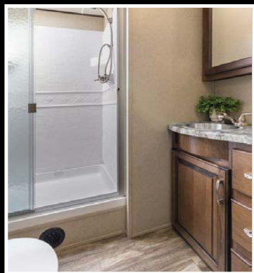
Spacious Master Bath (315RLTS Shown)