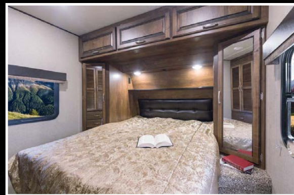
Residential Master Suite (297RSTS Shown)