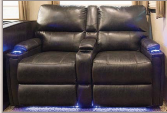
Heated wall hugger theatre seats w/ massage and led lights